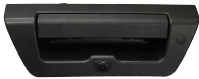
Tailgate Handle Camera Assembly