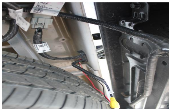
8. Run the cables through the hole on the bed and under the bed of the truck. We recommend running the cable under the passenger side of the truck bed.