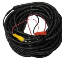
26 Ft. Extension Cable