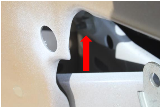
5. Remove the two 10mm nuts holding the tailgate handle.