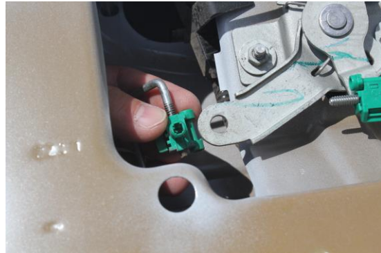
4. Remove the latch rod by pressing in the locks on the sides then pull back.