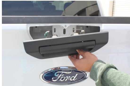
6. Carefully remove the tailgate handle assembly by lifting the handle and pulling slightly upward. Remove the OE lock and install it on the CFD-15KL.