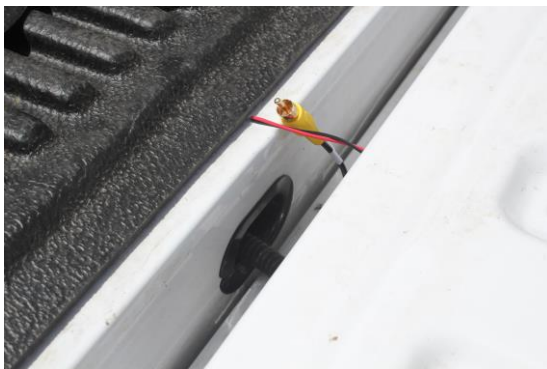
7. Fish the video and power cables inside the tailgate towards the bed of the truck.