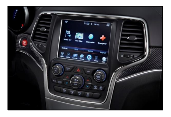
8.4" Uconnect Radio (1-Piece Radio)