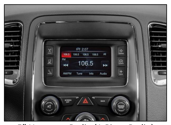
5" Uconnect Radio (1-Piece Radio)