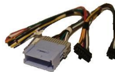
GM-18B Harness (GM-2B)