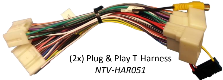
(2x) Plug & Play T-Harness NTV-HAR051

Agreement: End user agrees to use this product in compliance with all State and Federal laws. NAV-TV Corp. would not be held liable for misuse of its product. If you do not agree, please discontinue use immediately and return product to place of purchase. This product is intended for off-road use and passenger entertainment only.