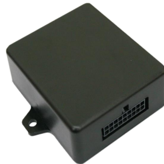
Sonata-CAM Module NTV-ASY171