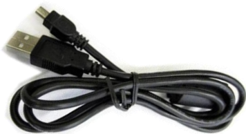
USB Cable (updates) NTV-CAB009